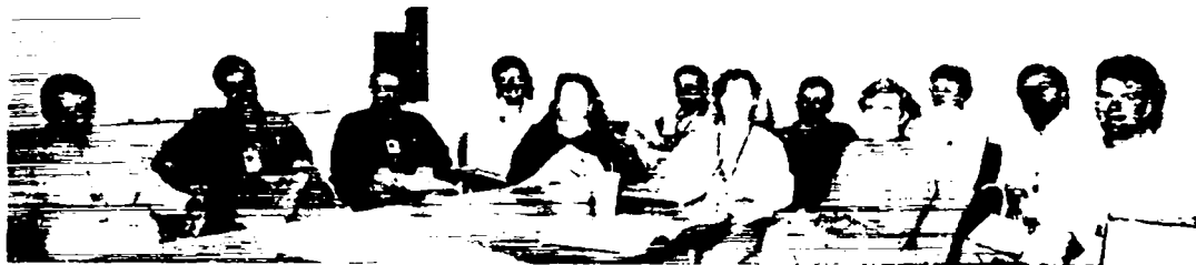
ALARA Committee Members

One of the challenging areas for the ALARA group is keeping up with the changing regulations and reporting requirements. Last year the DOE and the Laboratory each issued a new Radiation Control Manual . The TA-55 ALARA committee reviewed and commented on these documents prior to release.